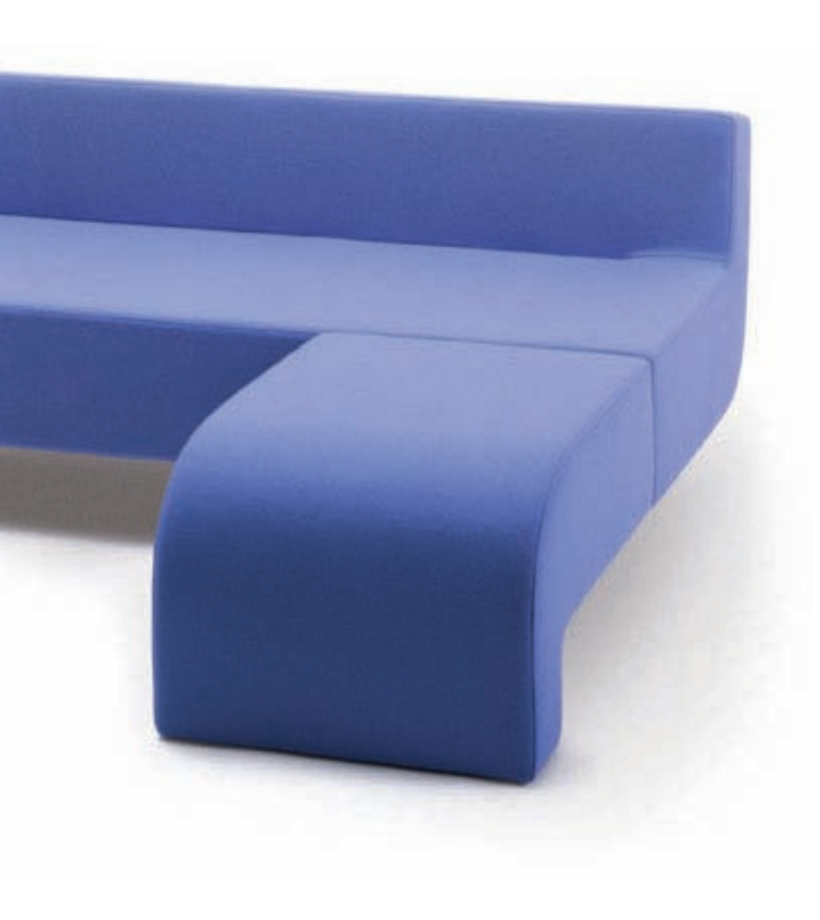
hm30g can be used either as a corner element or as an ottoman

This collection designed by Shin and Tomoko Azumi is suitable for both residential and contract situations. The range comprises asymmetric seat units with two and three-seat sofas that can be used alone, or combined with a corner ottoman to create larger seating arrangements. A moveable armrest is also available, and low tables with acid-etched glass tops complete the collection. Frames are of solid beech and panel construction, upholstered in graded CMHR foams. Legs and table frames are of satin-chromed steel. The seating is available in a choice of fabric coverings. Seat height 410mm