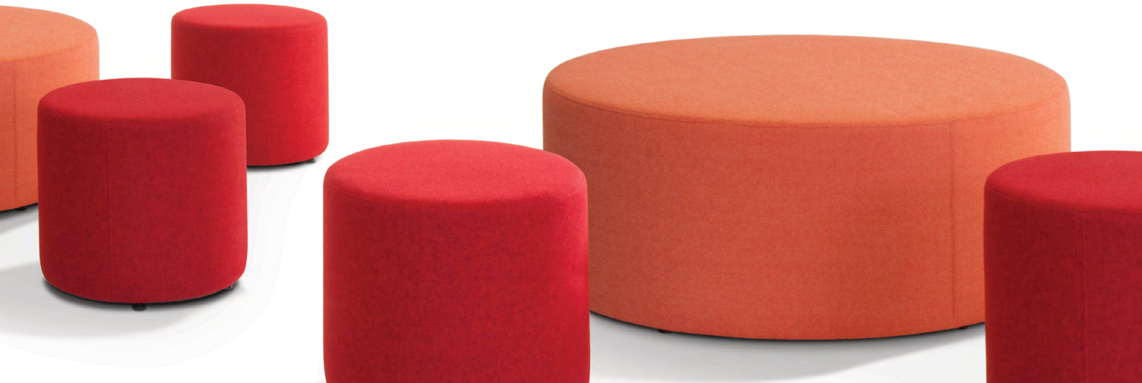
hm51b and hm51e

Made from FSC-sourced hardwood and panel construction with multi-density foam, with adjustable feet, the collection is sturdy and robust, ideal for all contract environments. Power and data modules can be integrated and bespoke sizes are available; please contact us with your requirements.